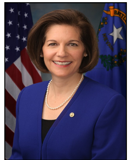
U.S. Senator Catherine Cortez Masto

Sponsored by Bowie State University's Department of English & Modern Languages