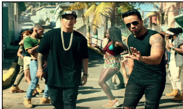
Daddy Yankee and Luis Fonsi